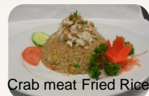
Crab meat Fried Rice