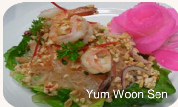
Yum Woon Sen

Larb Kai Salad Minced chicken & salad mixed spicy lime juice, onion and cilantro.....8.95