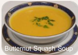
Butternut Squash Soup

Tom Yum* (Lemongrass Soup) Tofu or Chicken ...4.95, Shrimps ...5.95, Seafood ..... 8.95 Hot and sour soup, mushrooms, bell pepper, onion in lemongrass-lime base