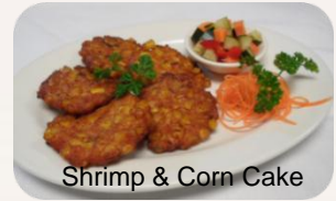
Shrimp & Corn Cake