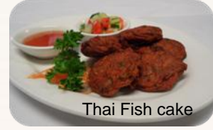
Thai Fish cake

( Little Spicy, Very Spicy, Extra Spicy, Hot)