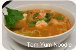
Tom Yum Noodle