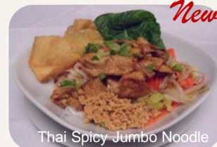
Thai Spicy Jumbo Noodle

Pad Thai* Famous stir-fry rice noodle, tamarind citrus, bean sprouts, egg and crushed nuts Shrimps .... 13.95, Chicken or Tofu .....11.95