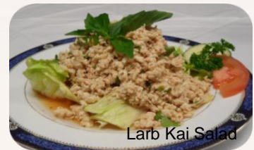
Larb Kai Salad

Salad Kae V Salad, carrots, onion, cucumber, tomato, tofu with peanut dressing.....6.25