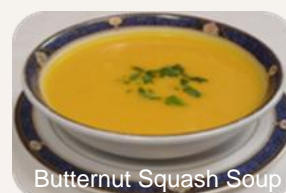
Butternut Squash Soup