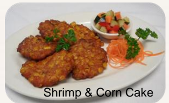
Shrimp & Corn Cake

Gyoza Dumpling .....5.95 Fried or steamed stuffed with grounded chicken and cabbage with sweet sour soy sauce