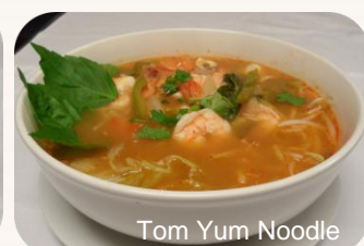
Tom Yum Noodle

Extra jasmine rice / Brown rice / Noodle.....1.99