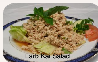
Larb Kai Salad

Salad Kae V Salad, carrots, onion, cucumber, tomato, tofu with peanut dressing.....5.95