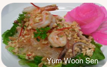
Yum Woon Sen

Larb Kai Salad Minced chicken & salad mixed spicy lime juice, onion and cilantro.....6.95