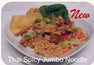
Thai Spicy Jumbo Noodle