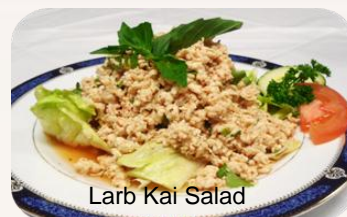
Larb Kai Salad

Salad Kae V Lettuce, carrots, onion, cucumber, tomato, tofu with Peanut Dressing.....5.95