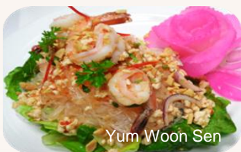
Yum Woon Sen

Larb Kai Salad Minced chicken topped salad mixed with spicy lime juice, onion and cilantro.....7.95