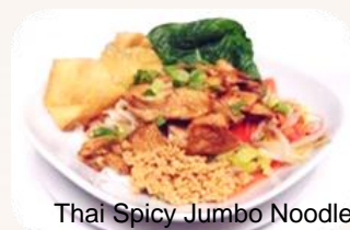
Thai Spicy Jumbo Noodle

Extra jasmine rice / Brown rice / Noodle.....1.50