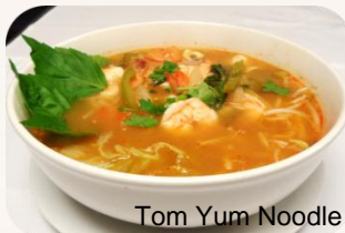
Tom Yum Noodle