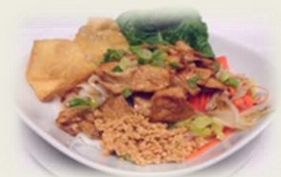
Thai Spicy Jumbo Noodle

Singapore Noodle* Sautéed rice noodle, chicken , egg, napa, broccoli, carrot, mushroom, baby corn, curry powder in soy garlic sauce..... 11.95