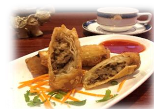
Cheesesteak Egg Rolls