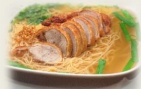
Duck Noodle Soup

Thai Spicy Jumbo Noodle* (Thai Style) Chicken , jumbo noodle (rice & wheat), crispy wonton skin, carrot, bean sprout, lettuce and scallion in spicy sweet & sour tamarind sauce and peanut crushed topped..... 11.95