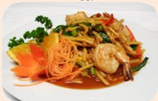
Thai Baby Bamboo