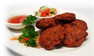
Thai Fish Cake

Thai Wings .....6.95 Fried crispy chicken served with sweet & sour chili sauce