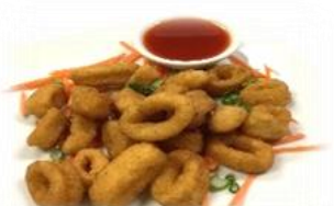
Breaded Calamari Ring