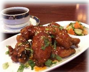
Spicy Fried Wings

Gyoza Dumpling .....6.95 Fried or Steamed wheat skin dumpling stuffed with minced chicken, onion, garlic and cabbage served with sweet sour soy sauce