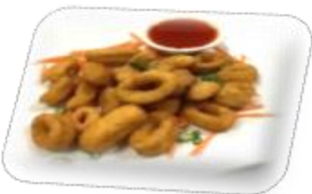
Breaded Calamari Ring