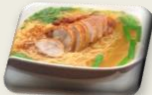
Duck Noodle Soup