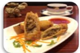
Cheesesteak Egg Rolls