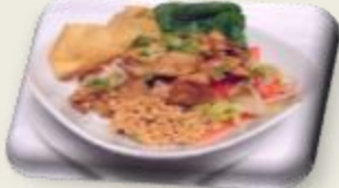
Thai Spicy Jumbo Noodle

Duck Noodle Soup Slices of Fried 1/4 duck, egg noodle(wheat), bean sprout, scallion, cilantro., fried garlic & chive leaves in light soup..... 19