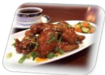
Spicy Fried Wings