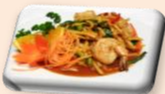
Thai Baby Bamboo