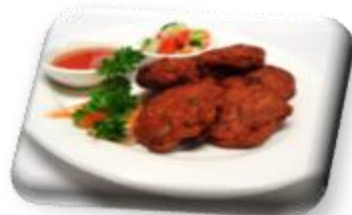
Thai Fish Cake

Thai Wings .....9 Fried crispy chicken served with sweet & sour chili sauce